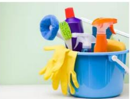
Cleaning & Hygiene Industries