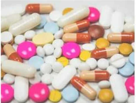
Pharma Intermediate Industries